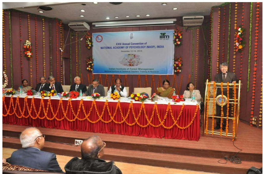
Opening ceremony of National Academy of Psychology, Bhopal, India in December 2014