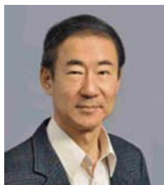
Organizer: Masataka Watanabe

The organizing committee will hold five special symposia that represent the main topic of ICP2016. Three symposia are introduced here. For the latest list of speakers and more information, please see http://www.icp2016.jp/program01.html