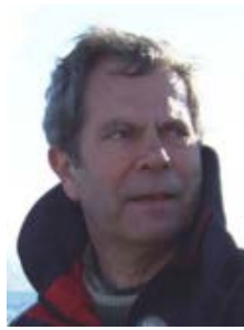
Richard G M Morris

Center for Cognitive and Neural Systems, The University of Edinburgh, UK