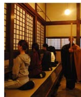
Zazen "seated meditation"

Zazen is considered the heart of Japanese Soto Zen Buddhist practice. The aim of zazen is just sitting, that is, suspending all judgmental thinking and letting words, ideas, images and thoughts pass by without getting involved in them.