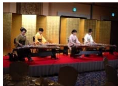
Japanese harp performance

Optional tour for anyone interested in Zen practice conducted in English