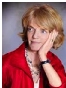
Patricia S. Churchland Department of Philosophy, University of California, USA Title: TBA