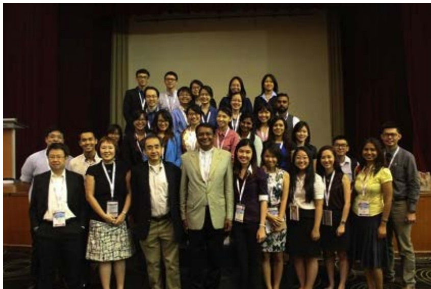
ICP promotion in Singapore at the ASEAN Regional Union of Psychological Societies meeting (March, 2015)

Attending various psychological meetings and engaging in promotional activities, such as talking with people at a promotion booth or giving promotional speeches at every possible occasion, are important aspects of the organizing committee's promotional activities. We had a big booth at ICAP2014 in Paris. Many people visited our booth, giving us the opportunity to talk to many people from all over the world. After that event, we have concentrated on the activities in Asia. We sent people to annual meetings of the Chinese Psychological Association (October, 2014, Beijing), the Taiwanese Psychological Association (November,