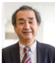
Organizer: Takao Sato

The organizing committee will hold five special symposia that represent the main theme of ICP2016. Here we introduce one symposium. For the latest list of speakers and more information, please see http://www.icp2016.jp/program01.htm