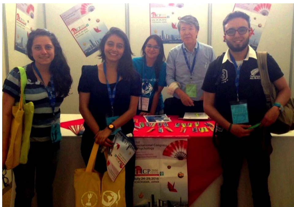
ICP2016 Booth, Latin American Regional Conference of Psychology 2015

We look forward to welcoming you in Yokohama , Japan.