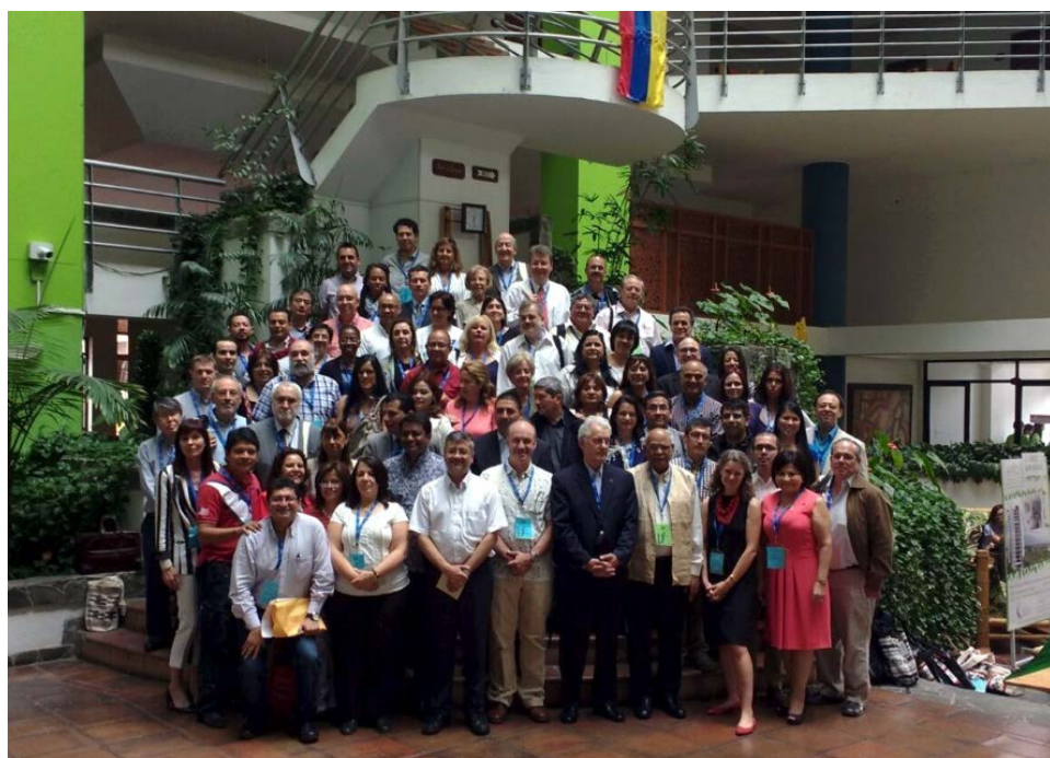
Latin American Regional Conference of Psychology 2015

We hope that many of the attendees of LARCP will meet again in Yokohama next year at ICP2016, where a meeting of Latin American Representatives will be held to follow up on further developments in capacity building.