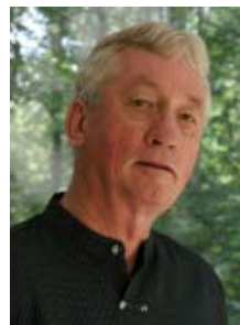
Frans B M de Waal Department of Psychology, Emory University, USA