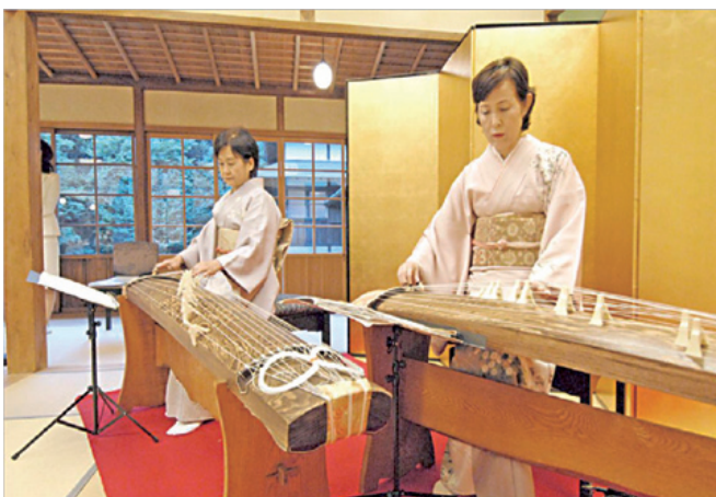
Japanese Harp Performance